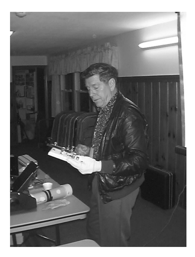
This one is worth a close up.