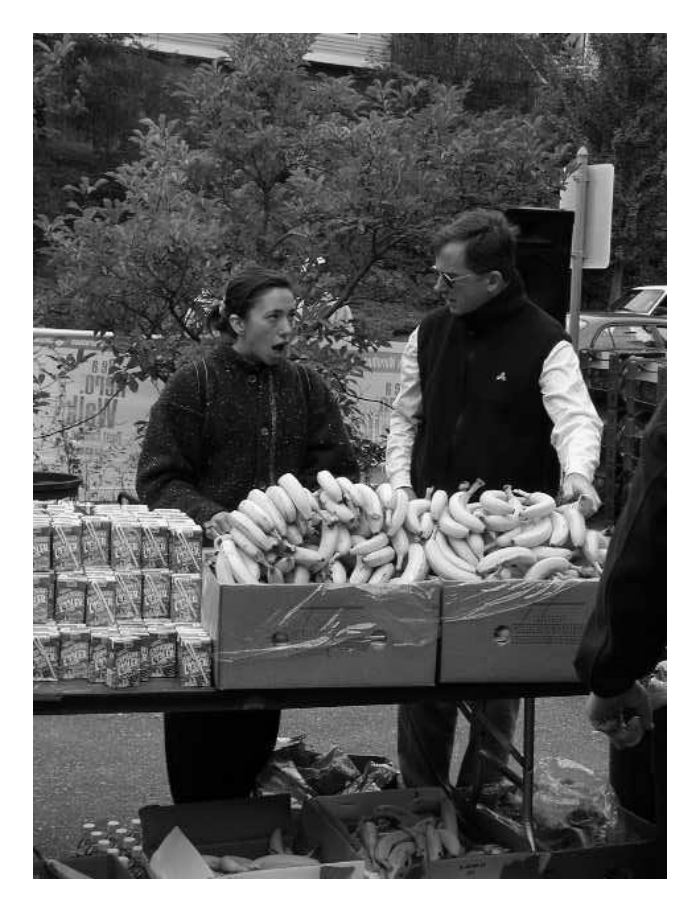
"You say we have to eat all the banana's we don't give to the walkers?"