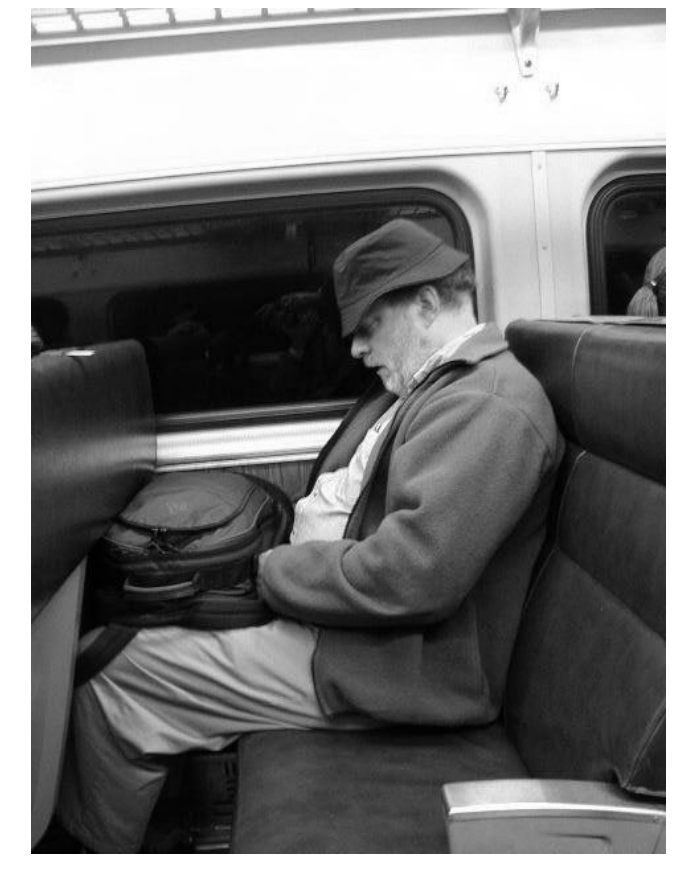
The Prez getting ready for another hard day at the office.