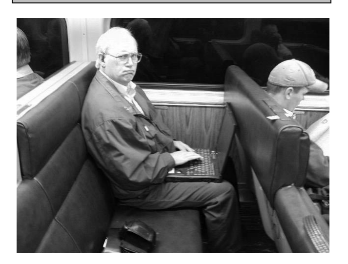
Grumpy newsletter editor working on the newsletter at 6:05 in the morning.