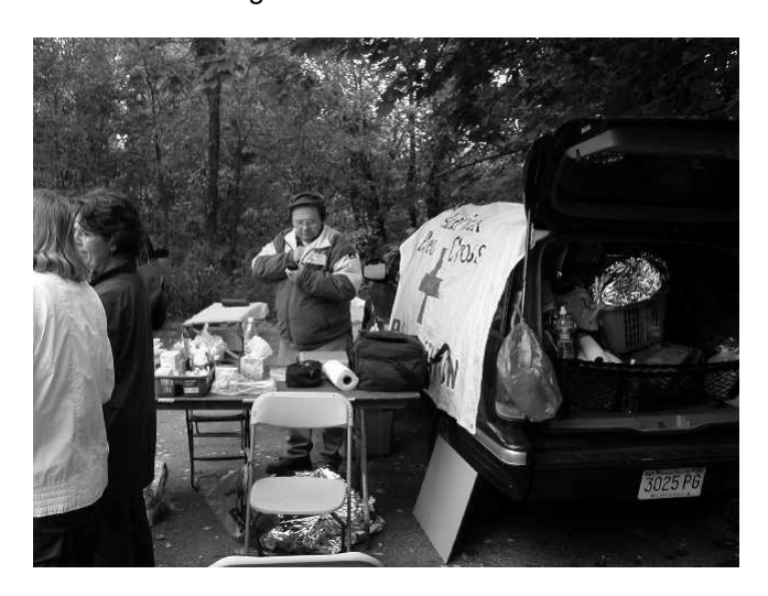
Pete KD1QS manning the Red Cross station.