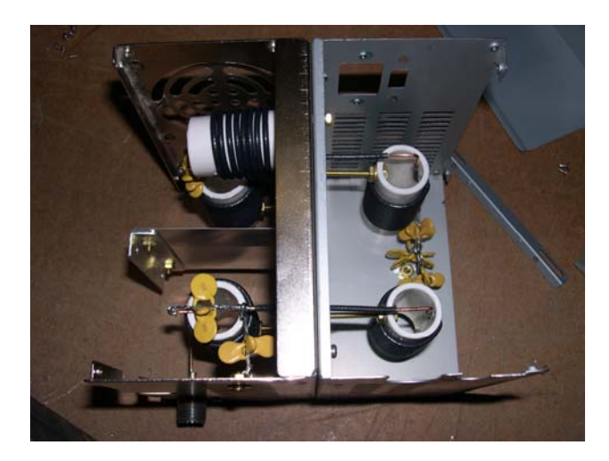
80 meter filter in a dual case.

As of the Filterfest the participants had filters for 20 and 40 meters. Two weeks later the second 15 meter filter was tested and accepted. This allowed the release of the rest of the 15 meter kits which were distributed starting March 26<sup>th</sup>.