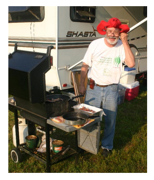
Only 5 months before we see this again!