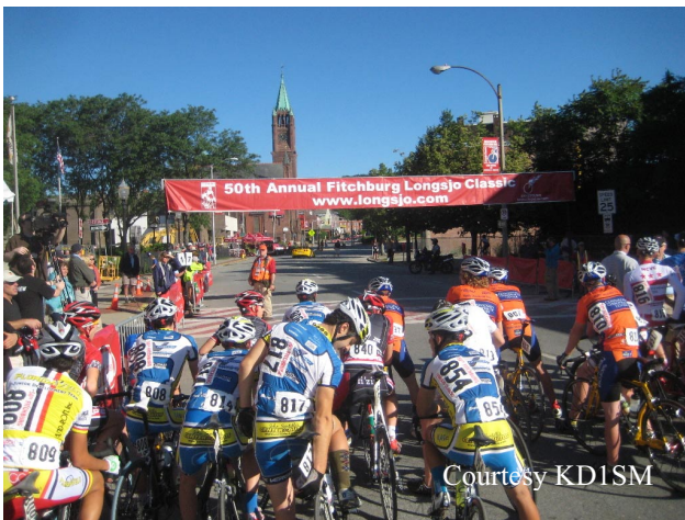
AB1CV stands underneath the start / finish line banner preparing a group of racers for their start.

Amateur Radio volunteers from MARA, NVARC, and the Mohawk Amateur Radio Club were stationed at 13 critical intersections around the Road Race course. Our task was to relay lead racer positions to the next location so that the course marshalls and Princeton and Westminster police officers could control the vehicle traffic. We had only one crash that required a medical call. The ambulance crew thanked us, noting that the response was much faster due to our presence.