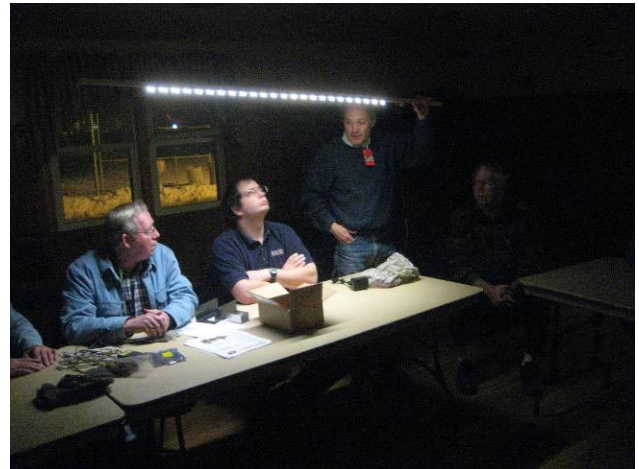
WA1TAC Rod with an LED light bar he was going to install in his shack.