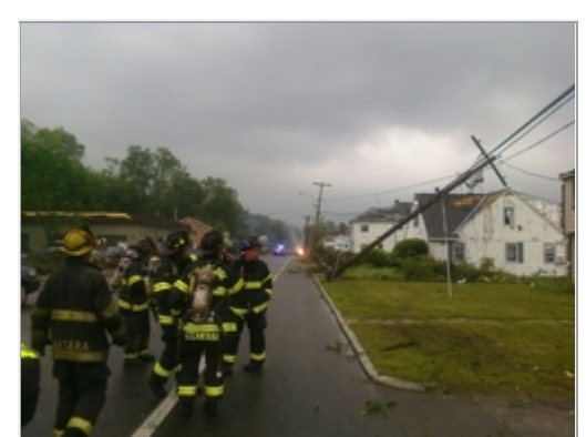
In Sturbridge, Massachusetts, state police officers survey the damage done by the tornado.

At least two tornadoes touche d down in Central Massachusetts late in the afternoon on Wedne sday, June 1.