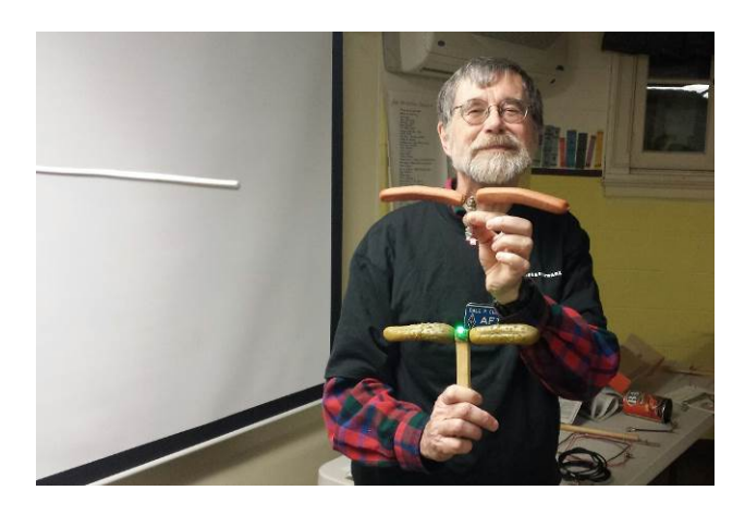
Dale AF1T and Double-Dill Dipole and Double-Dog Dipole.