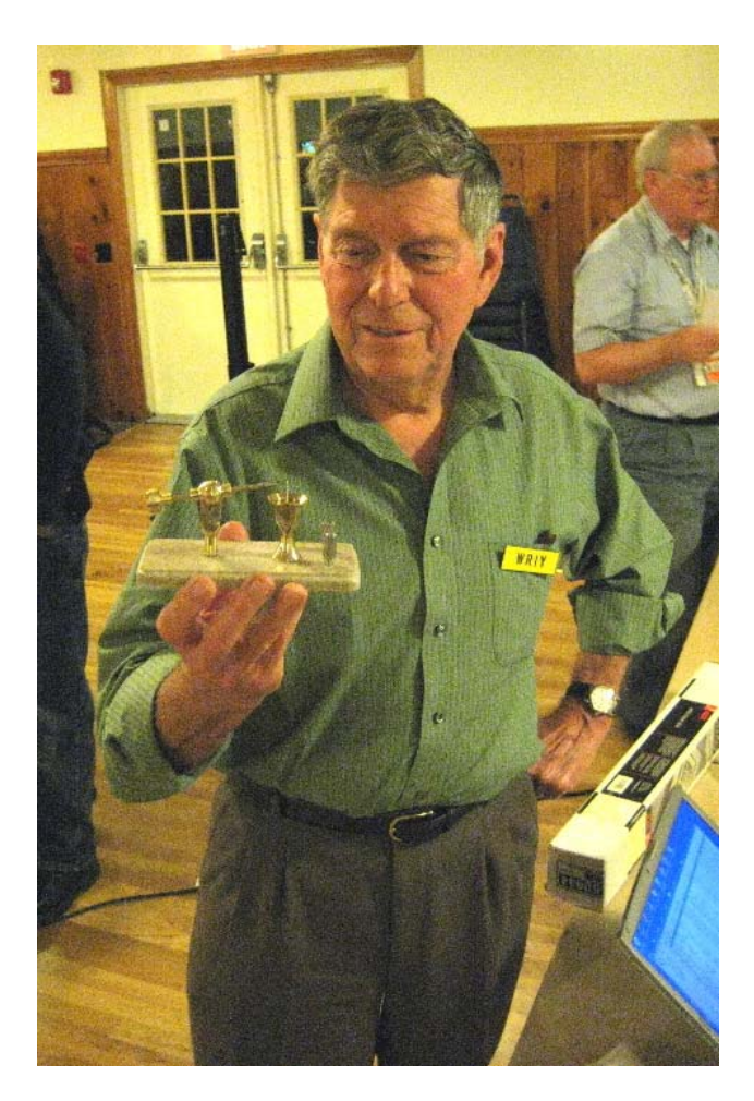
Another of Earl's creations