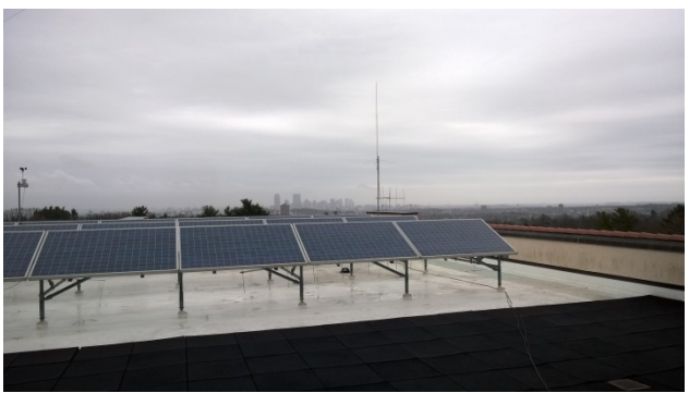
Looking out the windows from our location the Boston skyline was visible through the rain and fog.

My Boston Marathon was spent at a net control site off the course. From this location was run the bus net, medical resupply net, course nets (7) and had representatives from the Red Cross and BAA.