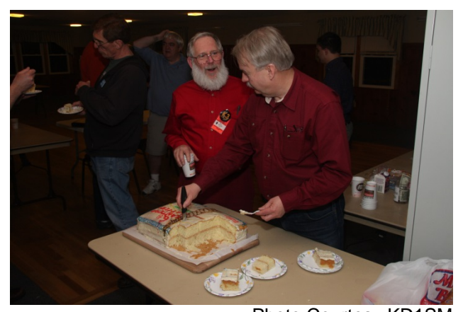
Above the LBC celebratory cake baked by Dan KW2T