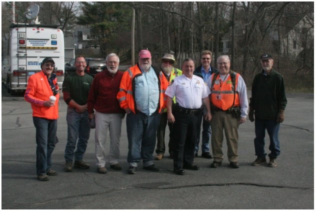
A few of the 30+ hams pose with Groton Police Chief Palma.