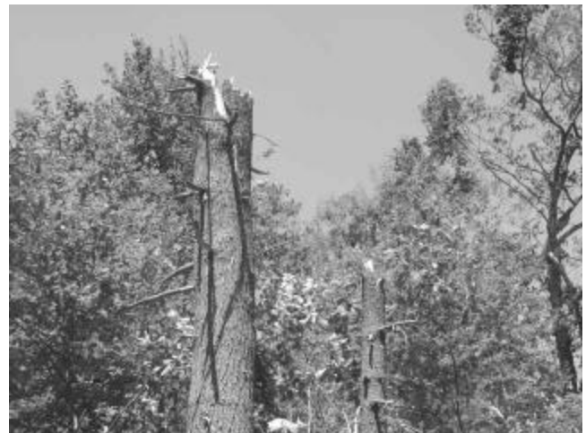
The above pictures are a reminder to the SKYWARN people and those who might be thinking about becoming