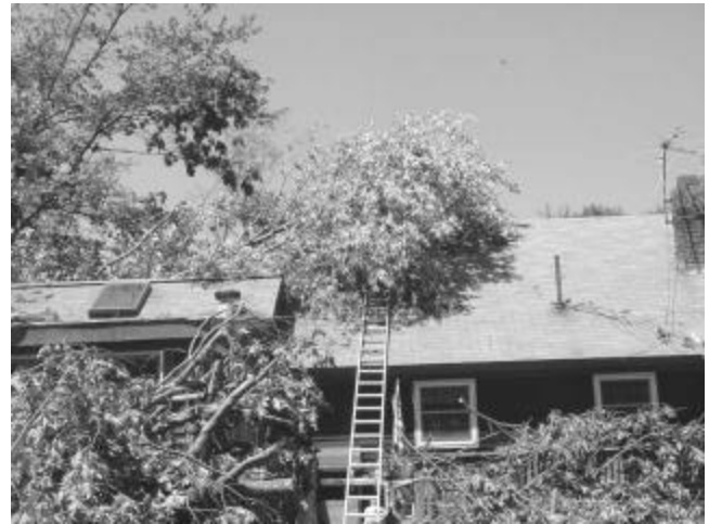
These are pictures of the Princeton tornado which occurred on June 17 th , 2001.