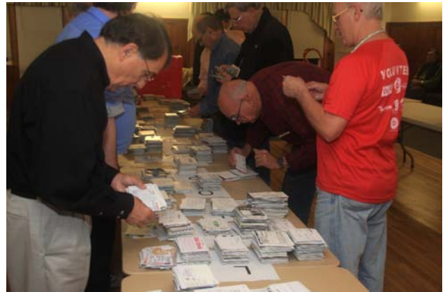
By 8:00 PM the cards had all been sorted into the sorting boxes. Pizza was ordered. Then the cards were consolidated onto the center row of tables where people could check to see if they had any incoming cards.