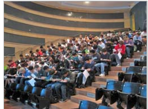
Almost 120 Cal Poly-SLO freshmen electrical engineering students sat for the Technician exam; 96 students passed the test.

electrical engineering students at California Polytechnic State University in San