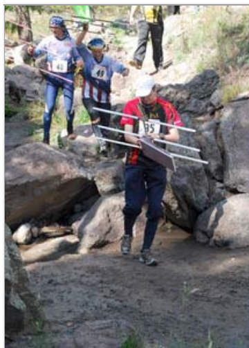
After leaving the 2 meter starting point, competitors had to be nimble to get down into the canyon that served as a corridor into the forest.

Results of the USA's 11th national championships of Amateur Radio Direction Finding (ARDF) are in the record books. Members of Albuquerque Amateur Radio Club went all out to provide a top-notch experience for fans of on-foot transmitter hunting, also called radio-orienteering and foxtailing. They came from 10 states and four other nations to see who would win medals by finding transmitters in the forests of central and northern New Mexico. From