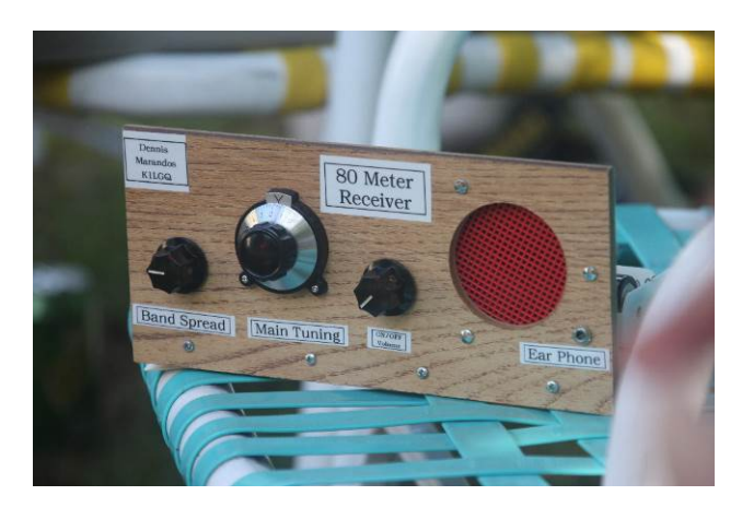
The front panel of Dennis' homebrew 80m receiver.