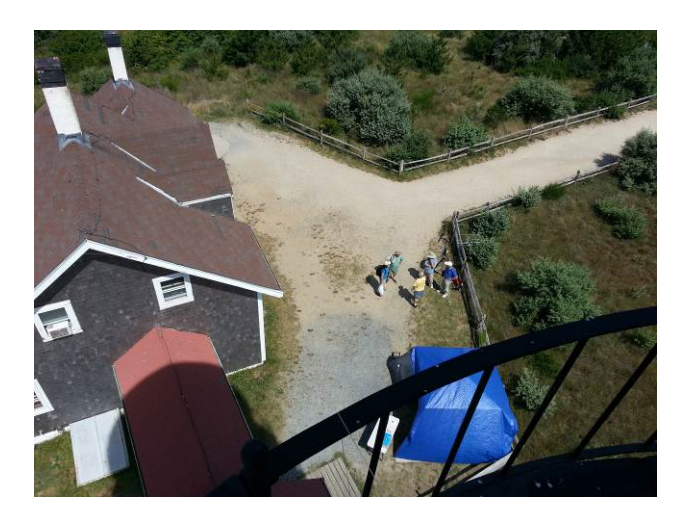
The blue tarp covers the operating tent. R-L are Skip, Dan, Stan and some visitors at Skips 10 GHZ rig and liaison 2 meter rig.

For the third year in a row, NVARC members used the third weekend in August to participate in International Lighthouse Lightship Weekend (ILLW). N1NC was on the air from historic Cape Cod Highland Lighthouse (http://www.capecodlight.org) in North Truro on Cape Cod. 2013 had a record 526 lighthouses registered, but operating conditions were poor for the entire weekend.