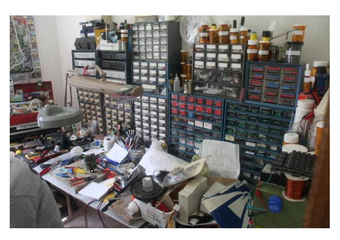
Dennis K1LGQ has a large parts inventory.