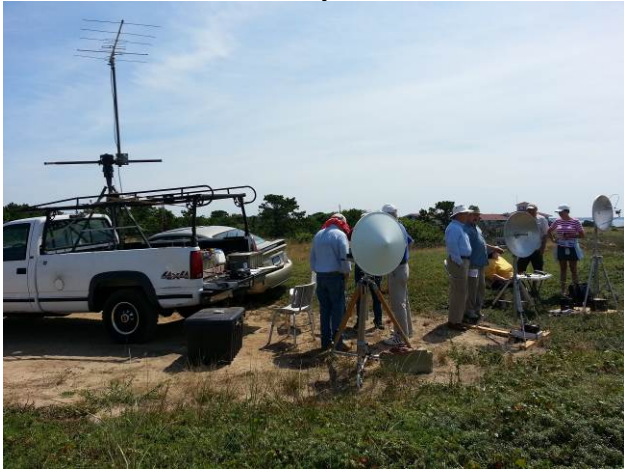
Jim N8VIM, Skip K1NKR, Dan KW2T and family also visited another site on the Cape where several other Hams were logging 10 GHZ contacts.