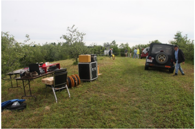
The equipment is unloaded in the vicinity of the SSB and CW stations. At the right is Bruce K1BG