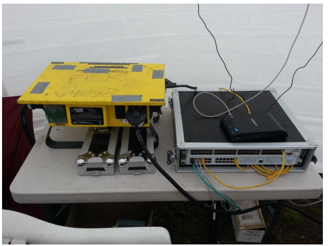
The center of power and networking provided by Jim N8VIM