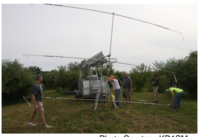
Above the tower and antenna crew attach the tribander to the tower.